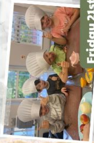
Friday 21st February Cooking & Baking