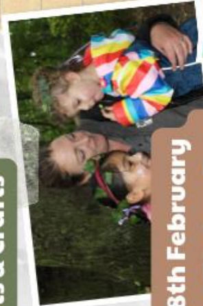
Tuesday 18th February Forest School/Nature Day

Email to book your place booking@rosedenenurseries.co.uk