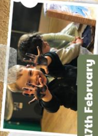
Monday 17th February Recycled Arts & Crafts