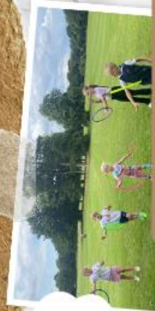
Thursday 20th February Sports Activities & Outdoor Games