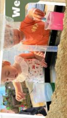
Wednesday 19th February Science Exploration